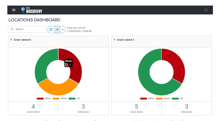
RFiD Discovery software - Stock level monitoring

The RFiD Discovery Stock Management solution provides healthcare organisations with an automated and reliable way to track, manage and optimise their medical inventory. Using RFID technology, the solution ensures full visibility of stock levels, protects high-value items, and supports efficient replenishment processes - reducing waste, avoiding stockouts and improving patient safety.